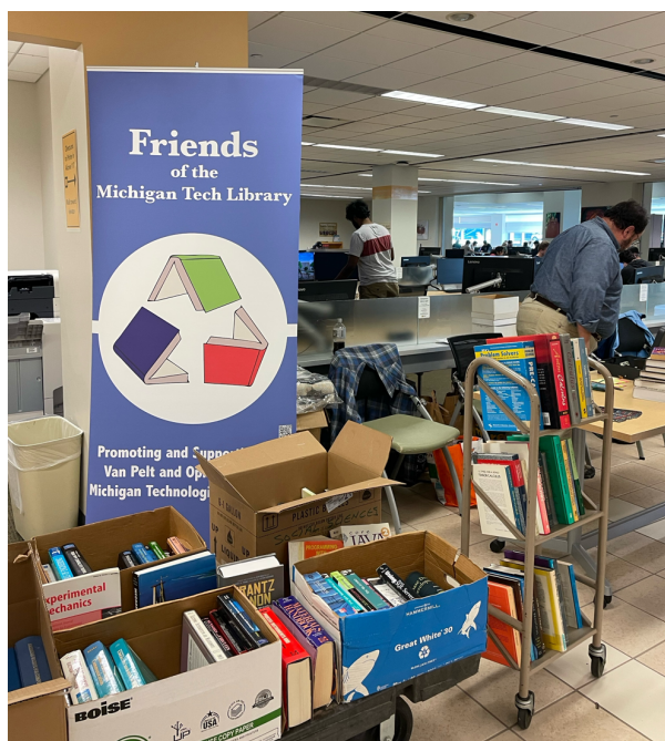
The Fall Book Sale takes place in the library lobby. Our Friends Michigan Tech Blanket was available as well as our historic Keweenaw note cards.

boosts our sales and is so convenient for our customers. Cash donations were also robust at the sale. We estimate that in cash sales alone we took in $560, sold a healthy quantity of our inventory, and gained some cash donations too. Final figures for our fall sale will be available at the end of October. Meanwhile, thanks to all of our volunteers and all the help we received from the library staff.