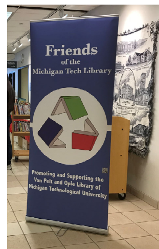
The Friends' new retractable banner guards the Michigan Tech blanket at the entrance of the 2019 Winter Carnival Book sale.