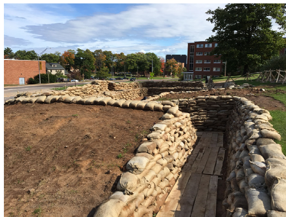
The WWI trench recreated on Michigan Tech's campus invites visitors to explore and immerse themselves in the history.