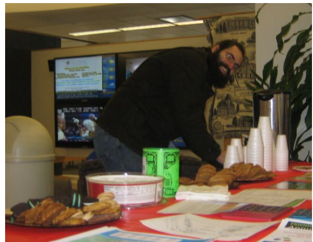
A visitor from NMU enjoys a cup of hot chocolate.